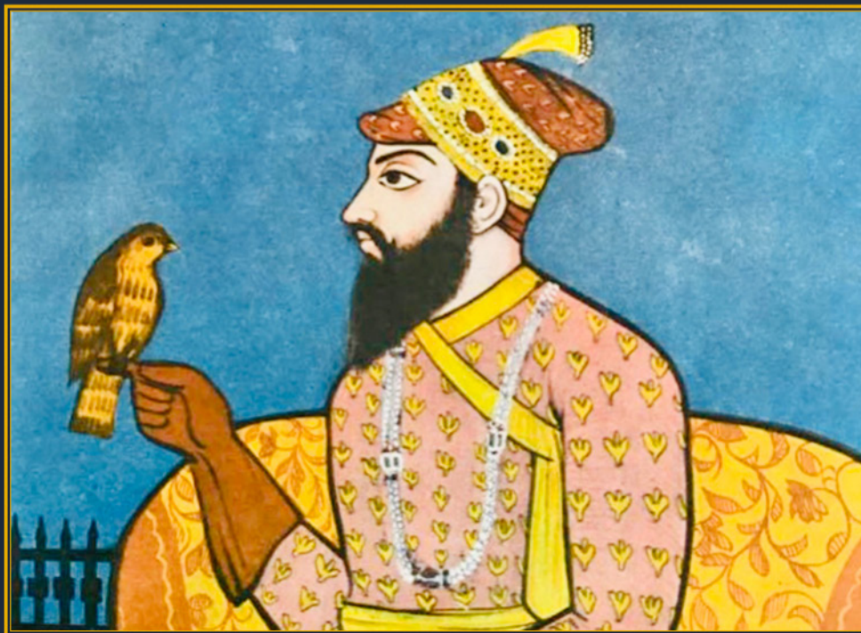
SHAHEEDI SRI GURU TEGH BAHADUR JI

A puratan painting of Sri Guru Tegh Bahadur Sahib Ji.